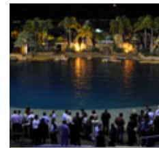
Private Dolphin Cove Show

The most spectacular of all events was by far the Gala Dinner which included a twilight private show by the Dolphins at Seaworld Dolphins Cove, followed by a vast fresh seafood buffet and wine to satisfy a well earned appetite.