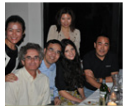
Dinner Solco & Astronergy

The Saturday morning activities concluded the Solco event as teams battled it in an all in scavenger hunt through the Seaworld park learning about the sea creatures and assortment of thrilling rides to enjoy!