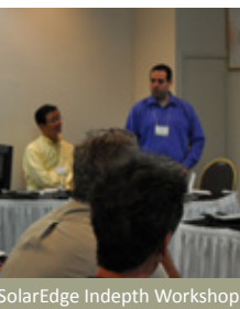
SolarEdge Indepth Workshop