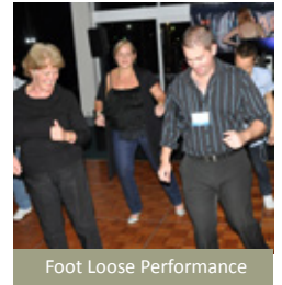
Foot Loose Performance

A jam-packed social schedule saw the guests enjoy the Welcome BBQ & Drinks pool to kick off the event in true Aussie style. The Thursday Night Dinner & Dance was interrupted by a surprise visitor who showed the guest how to carve up the dance floor and kiss some lucky guests. The live performing duo Kulaz encouraging some serious dancing all night long.